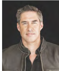
Brad Taylor Shadow Strike

On a Mission: The Smithsonian History of US Women Astronauts Thurs., Apr. 2 – 2 pm