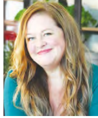
Kate Quinn The Astral Library