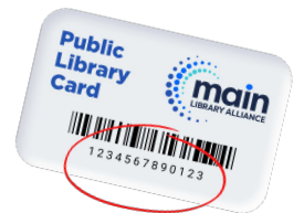
The full number should be typed.