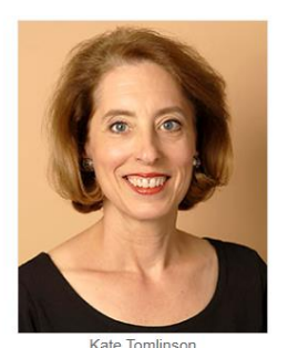
Speakers: Notable Women of New Jersey