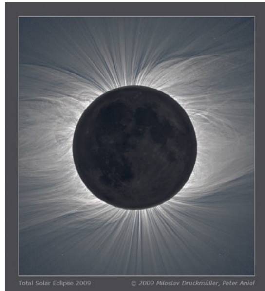
Total Solar Eclipse 2009