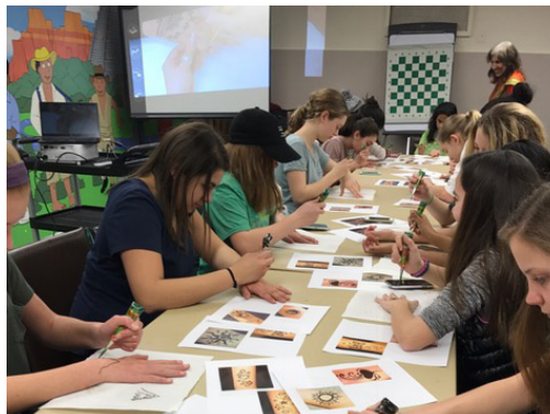
Teen Henna Workshop